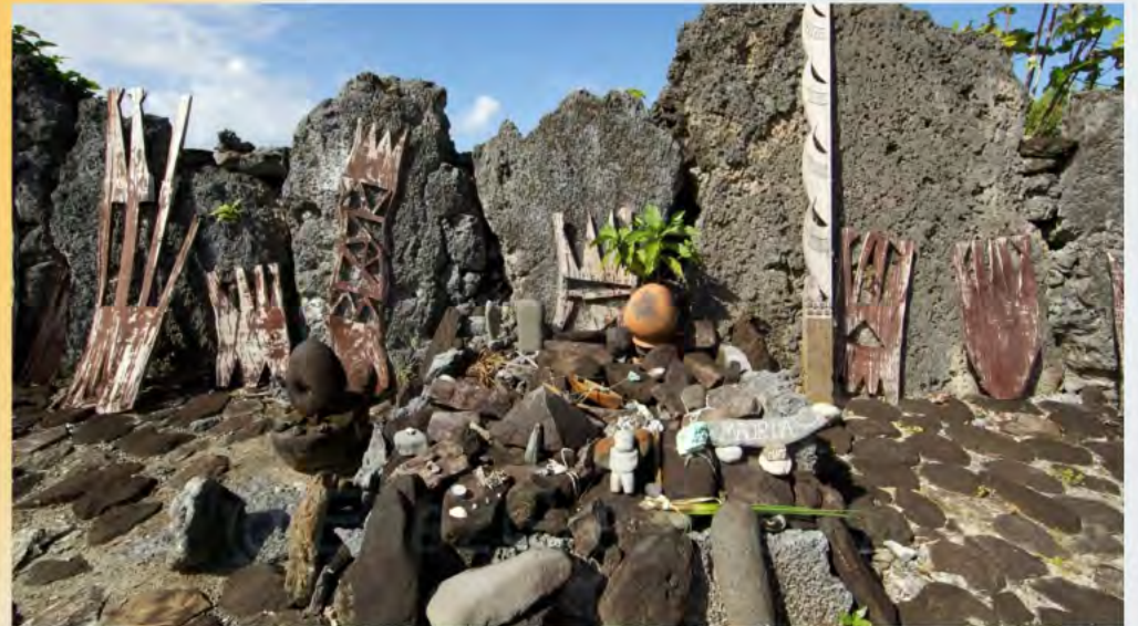
Offerings at Taputapuātea