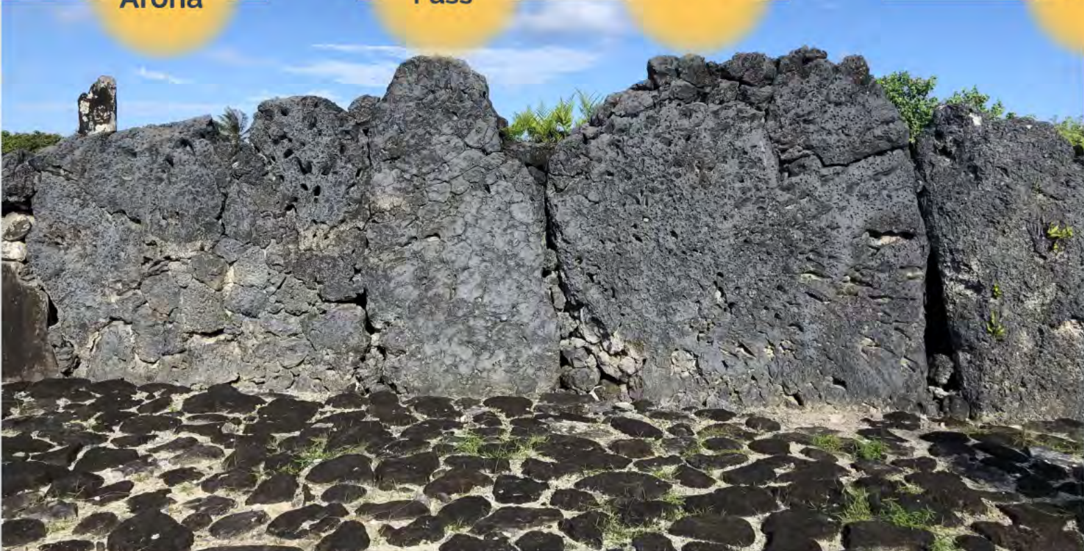
Stone walls at Taputapuātea