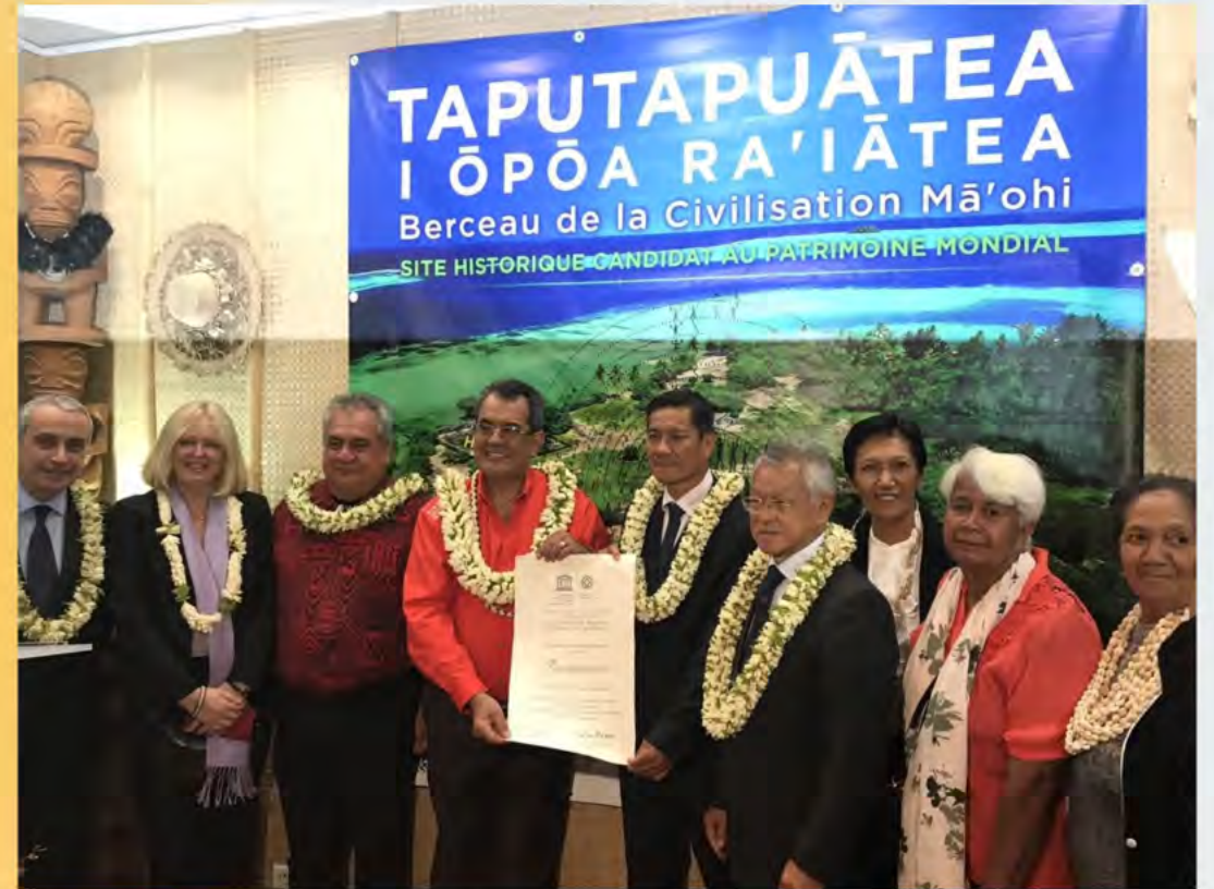
UNESCO ceremony, 2017

Due to its importance within the Society Islands and its significant influence on migratory, two-way voyaging to distant Polynesian archipelagos such as Hawai'i and Aotearoa, Marae Taputapuātea was designated as a UNESCO World Heritage Site in 2017.